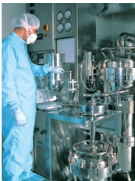
SUPERJET KOMPAK-2C, STANDARD VERSION

All components are inspected and certified by local authorities.