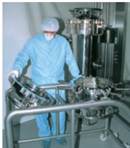
KOMPAK-2C, DETAIL OF COLLECTING BIN