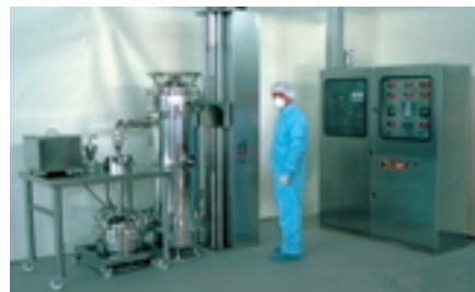
SUPERJET KOMPAK-2C WITH PHARMALIFT

400-600 grit Ra 0.16-0.25µm is also available. Materials, filters and roughness certificates are routinely supplied.