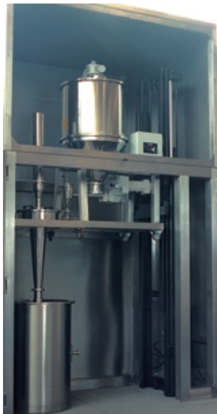
SUPERJET MICRONISER WITH ENCLOSURE

Top-discharge versions, without microniser's bottom cyclone are also available, being used to convey the product to the storage.